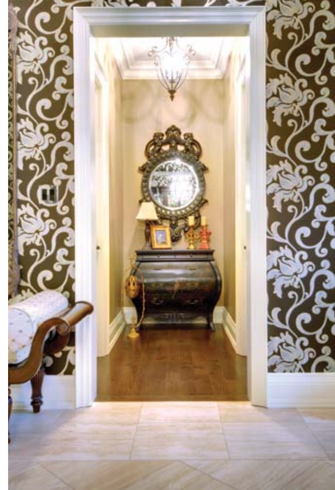
OPPOSITE PAGE: Tim, Aidan and Michelle Barker relax with their three-year-old Standard Poodle Rusty. LEFT: A nook off the grand foyer has two doors – one leads to the powder room while the other will soon become a large walk-in closet. BELOW LEFT: The powder room. BELOW RIGHT: The loft above the garage is a wonderful space to work and unwind.