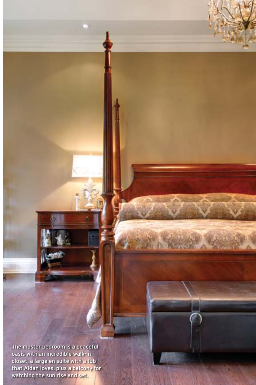
The master bedroom is a peaceful oasis with an incredible walk-in closet, a large en suite with a tub that Aidan loves, plus a balcony for watching the sun rise and set.

“Using some black or dark brown grounds a room,” she explains, acknowledging the neutral walls of the great room (Coffee Kiss 418-5 and Dark Granite 520-7 satin finish, from PPG’s Speedhide brand) that contrast with Monterey White (HC-27) trim, high baseboards, crown moulding and lofty ceilings (coffered and vaulted in some rooms to increase the lift and interest).